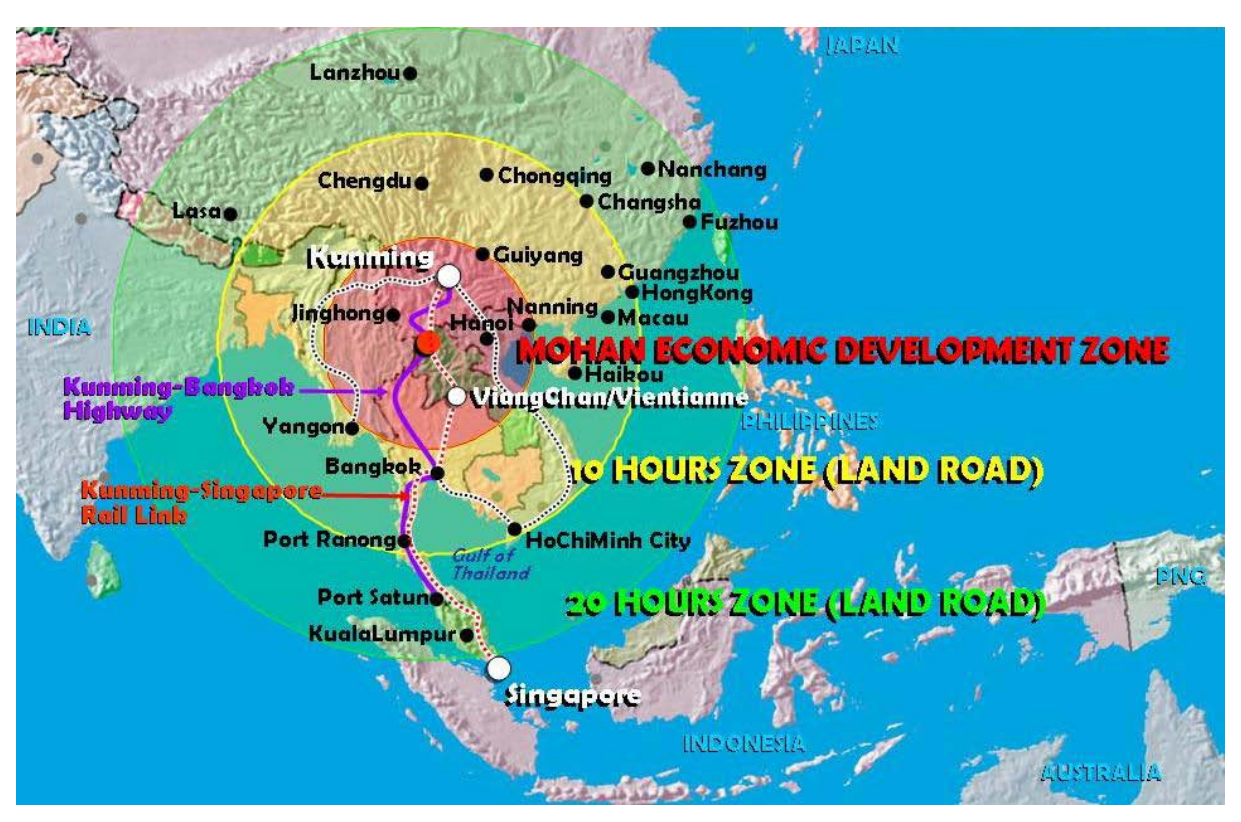
Figure 2. The Copper Silver Development JV properties are adjacent to the Mohan Economic Development zone on the Lao border with China. Currently Chinese government investment is facilitating a transport link from southern China to the Lao capital of Vientianne and further south to Bangkok and Singapore.

Information on the four Projects is set out below;