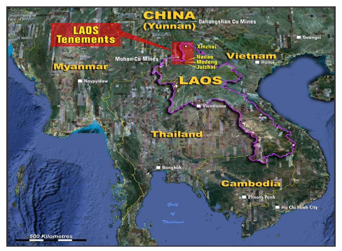
Figure 1. Locations of Jiuzhai, Xinzhai, Nadao and Modeng projects held by Sanmu in northern Laos

Chinalco Yunnan Copper Resources Ltd ( CYU ) and Yunnan Copper Industry (Group) Co. Ltd (YCI) confirm that drilling commenced at the Xinzhai project on 31 January 2012. Xinzhai project is one of the four projects in northern Laos that are 100% held by Yunnan Copper Sanmu Mining Industry Co Ltd (a joint venture in which CYU has an agreement to earn a 51% interest within one year).