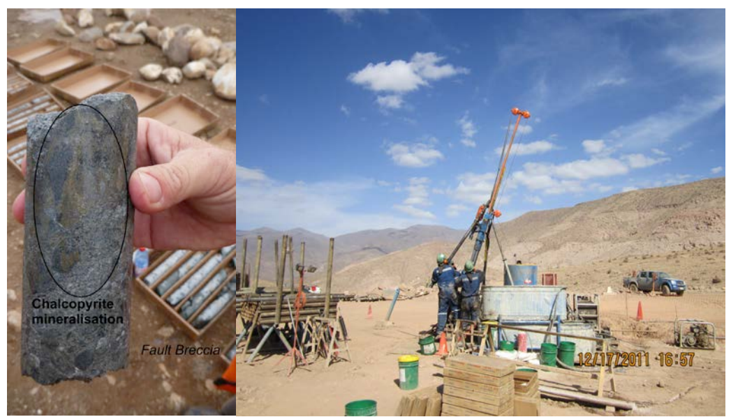
Copper Mineralisation from CAND0005 and Energold drillrig set up.

Copper is targeted at the Rio Tinto joint ventures in Chile at the Candelabro, Caramasa and Palmani porphyry properties. Surface mapping, sampling and geophysical surveys indicate these targets are highly prospective. Track and pad construction has been completed at Caramasa, which will be drilled after Candelabro from April. Road permitting has now been completed for Palmani.