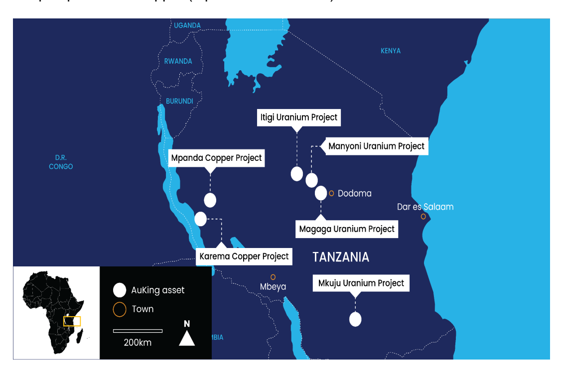
Figur e 3. Location of Tanzanian project areas

Four of the projects are prospective for uranium (Manyoni, Mkuju, Itigi and Magaga) and the other two are prospective for copper (Mpanda and Karema).