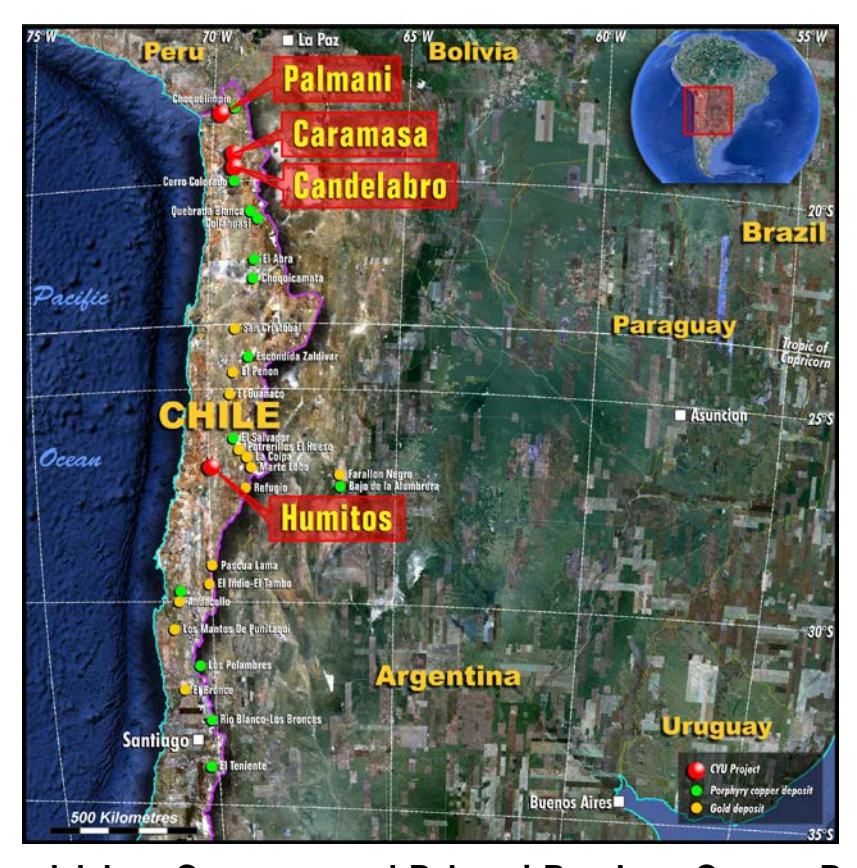
Figure 1. Candelabro, Caramasa and Palmani Porphyry Copper Prospects are being drilled in 2011/2012. All prospects are large tonnage concepts with known mineralisation occurring at each location as defined by JV partner Rio Tinto.

Chinalco Yunnan Copper Resources Limited (CYU:ASX) is pleased to provide an update with drilling commencing on the Candelabro Joint Venture in Northern Chile.